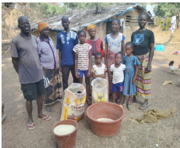
Brethren in the Kouankan refugee camp receiving their provisions.

We appreciate your support of Mission Guinea and ask that you keep this work and the brethren in Guinea and Voinjama- Liberia in your prayers.