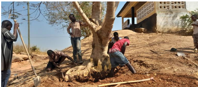
Dip storming the site for the children worship hall

A bundle of 14 gage is $ 60.00 USD X 4 = $ 240.00 USD.