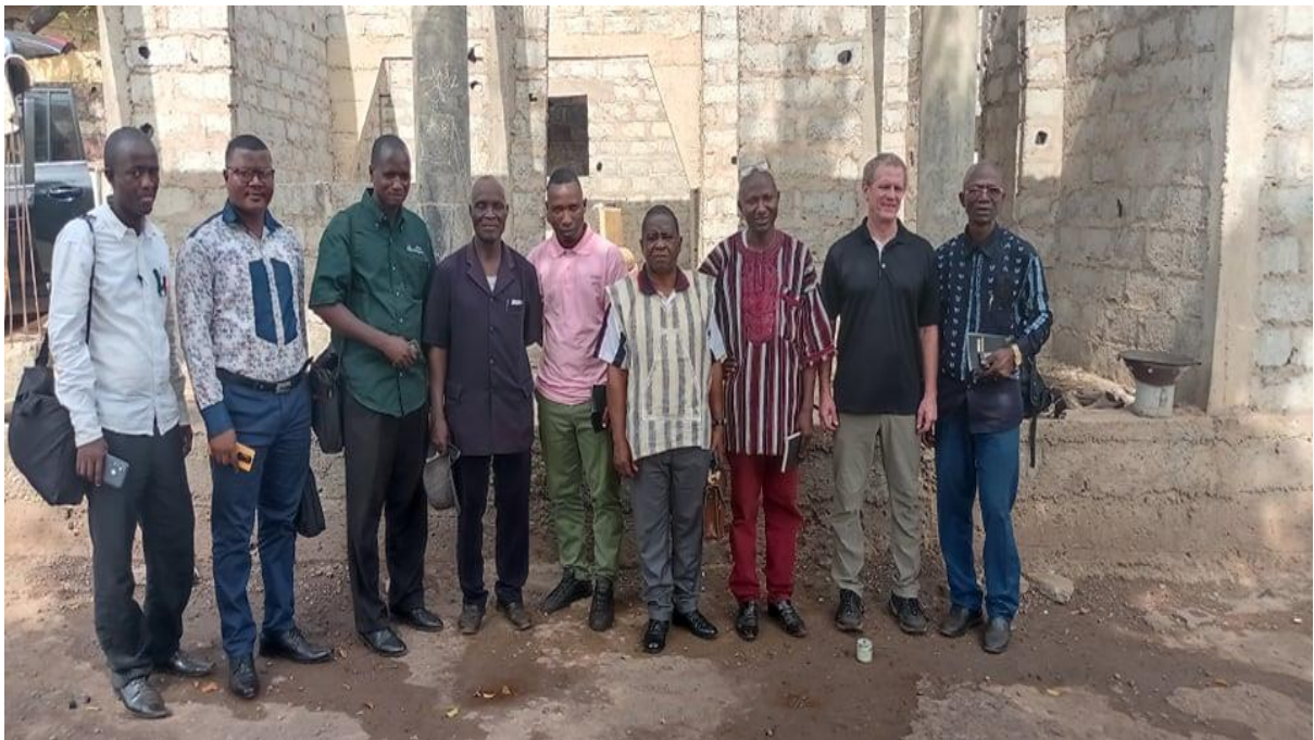
AFTER THE MEETING WITH BROTHER STEVEN AND CONAKRY LEADERS