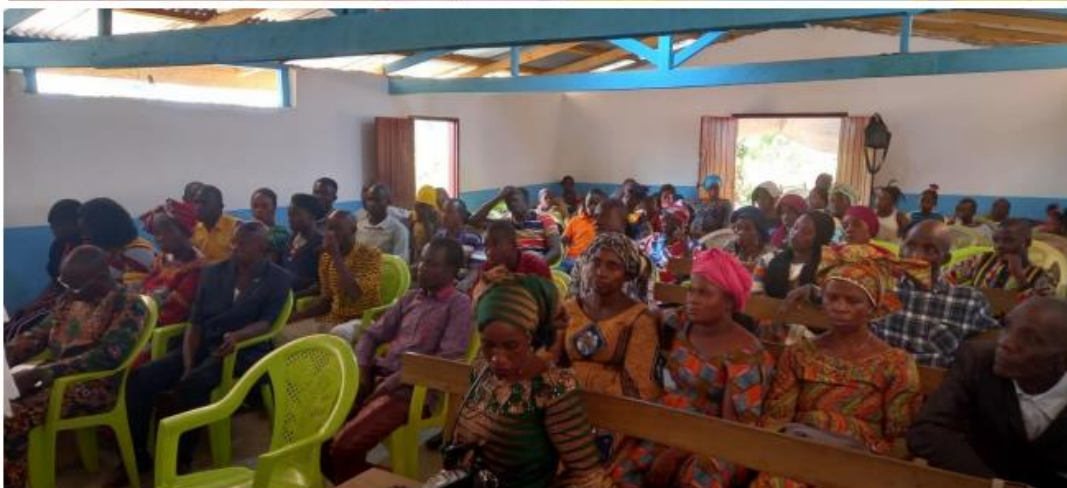
Preacher induction ceremony