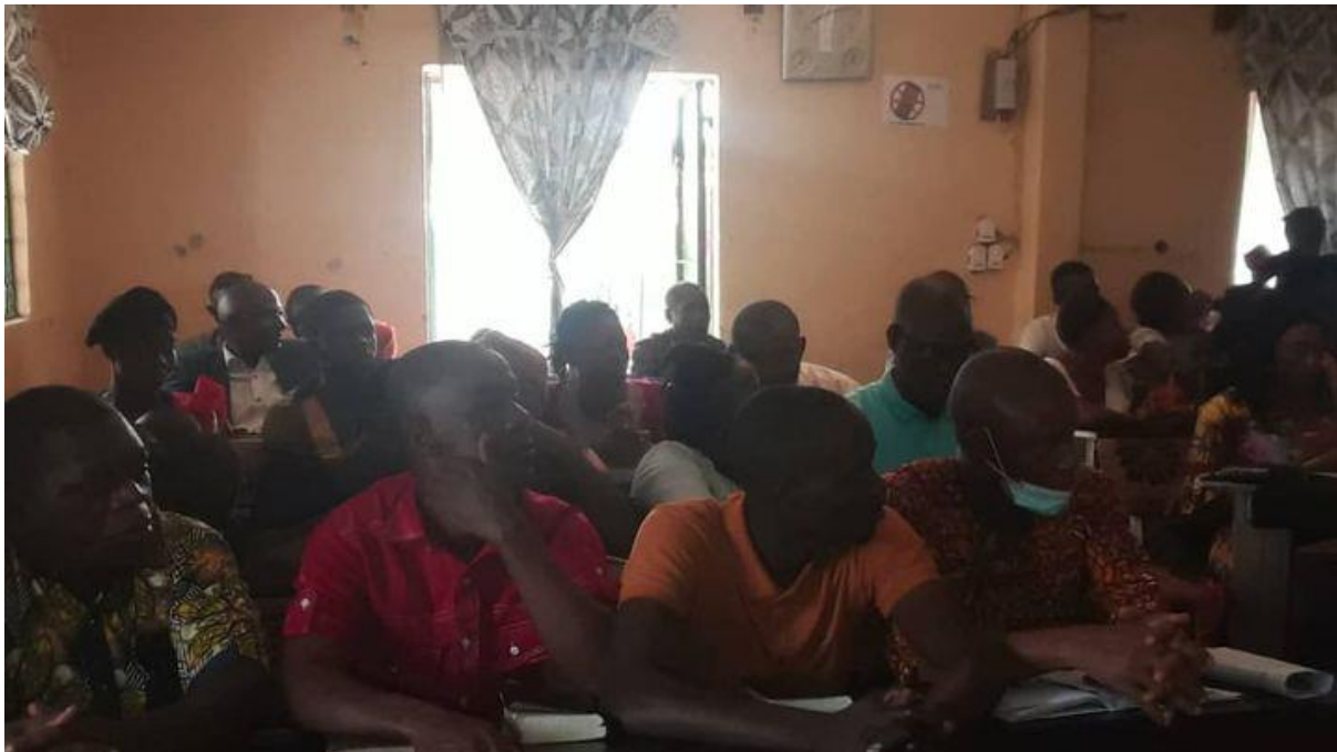
Members in church at conakry church