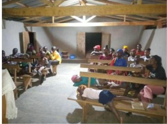
December 31 st watchnight