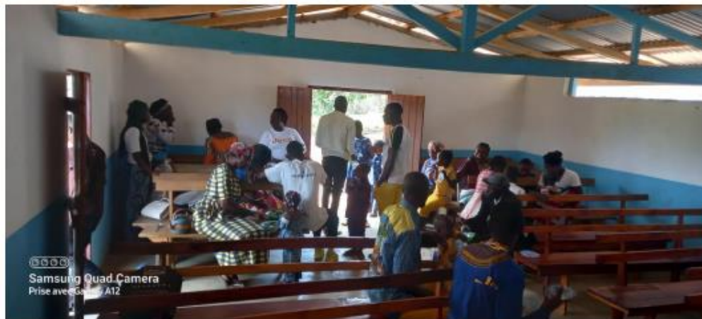
FRATERNAL MEAL SHARING