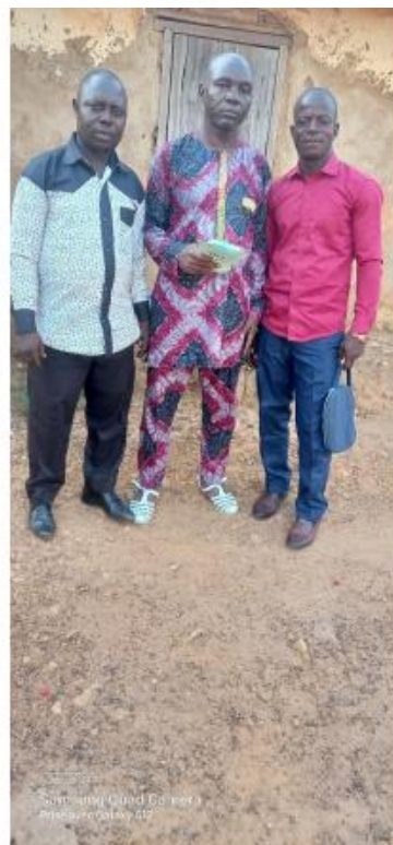
VISIT TO LOLA