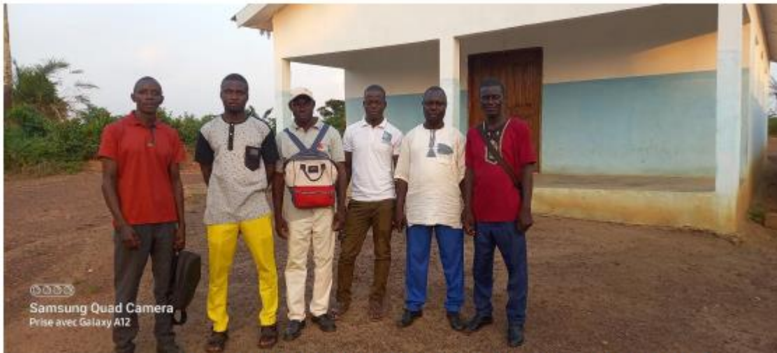
N'ZEREKORE EVANGELISM TEAM ON THE FIELD IN SAMOE