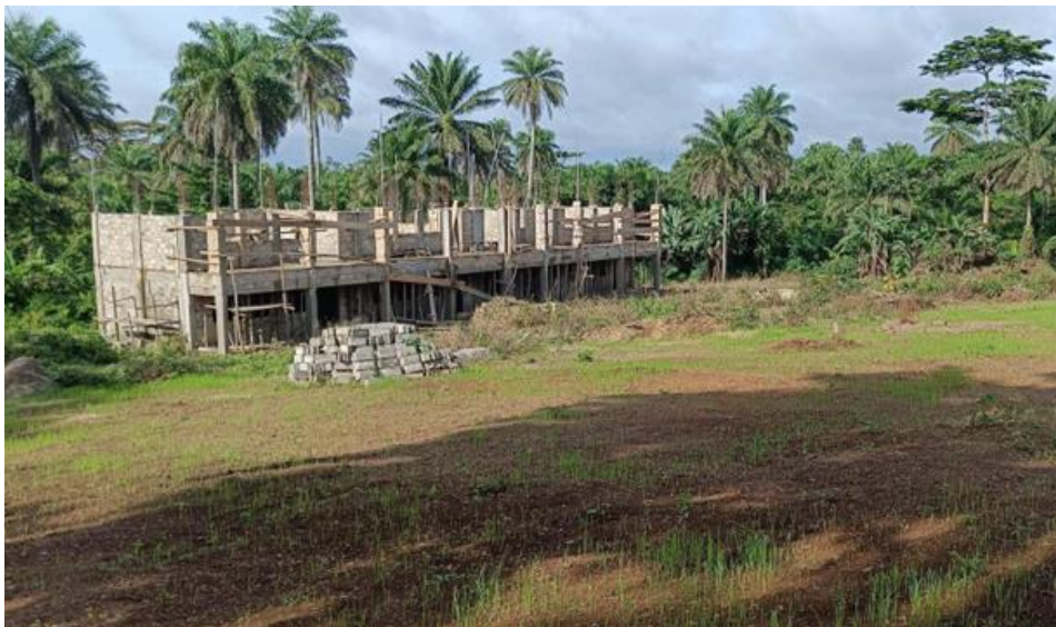
Progress made on constructing the bible training college (July 2023)

You may recall in our previous supporter's update, we reported on the progress of the bible training college construction where the second floor was installed, but the walls were yet to be completed. We are excited to report that the second floor elevation bricks and the walls are now completed. This is a great effort by local members of the church who used their building skills and knowledge to work together to complete this phase.