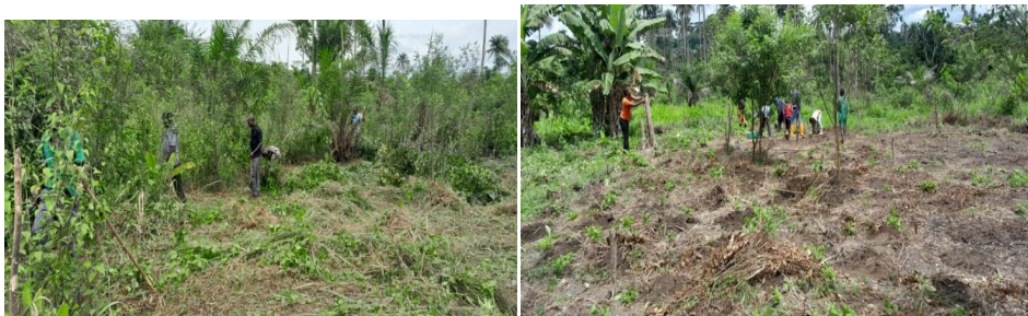
Brushing of the bush—few photos

We started the brushing and at the same time going out there to get the cassava sticks; we were successful.