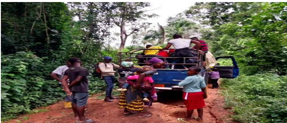
On the way to LISCO; we met with a bad hill and everyone is disembarking from the vehicle.