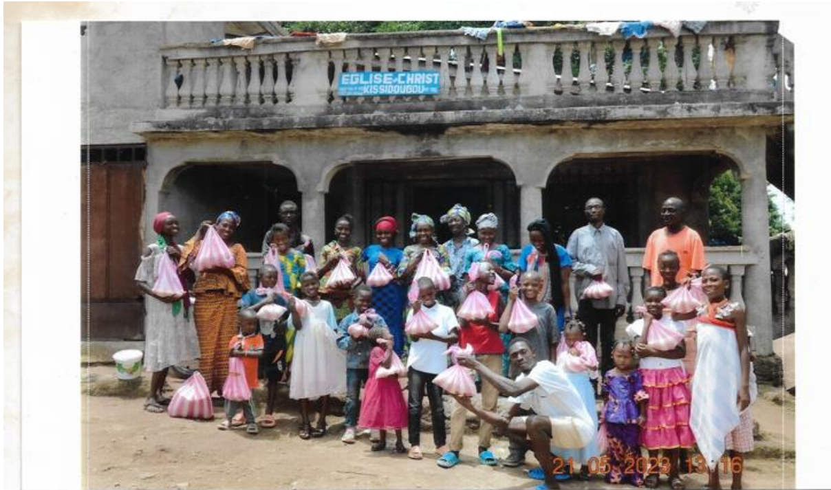
Brethren in Kissidougou receiving their bags of rice purchased through the support provided through Mission Guinea.

We appreciate your support of Mission Guinea and ask that you keep this work and the brethren in Guinea and Voinjama- Liberia in your prayers.