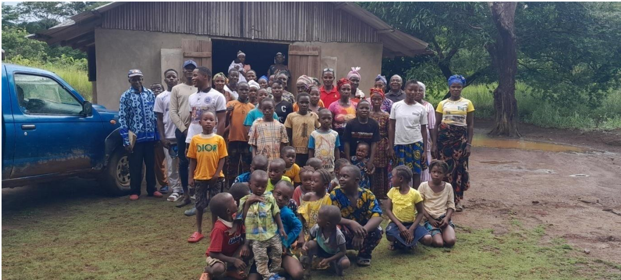
This Saturday gospel meeting at Mid Baptist place of worship. The topic: The Church.

On Saturday, we met with the Mid Baptist Church and Pentecostal church members in the place where the Mid- Baptist Church’s worship center.