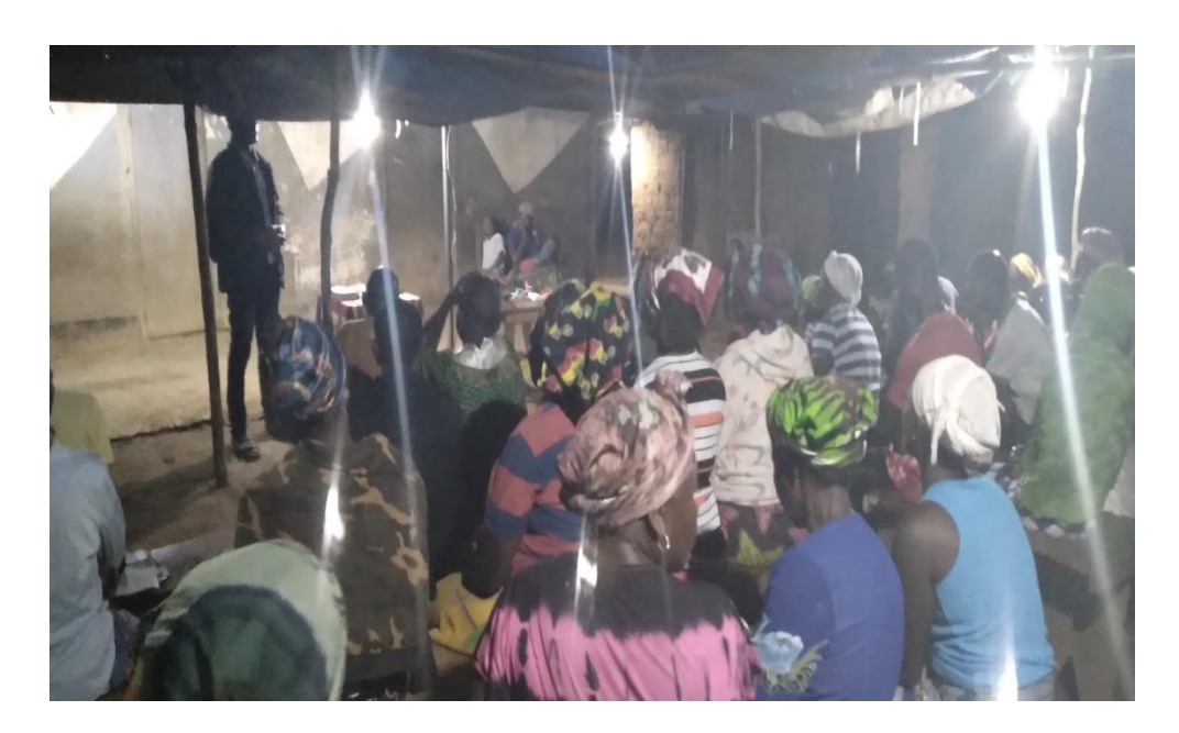
The next photo in Lisco.

The Mid Baptist members in Lisco, after our two days evangelism tour there want to be added to the Body of Christ. The only challenge they have now as they told us was that, the man who established that church is not there in Lisco; and they will inform him and give us the feedback. It was concluded that we visit Lisco every month and we have decided as a Church to do so. Lisco is about 32 miles from Voinjama.