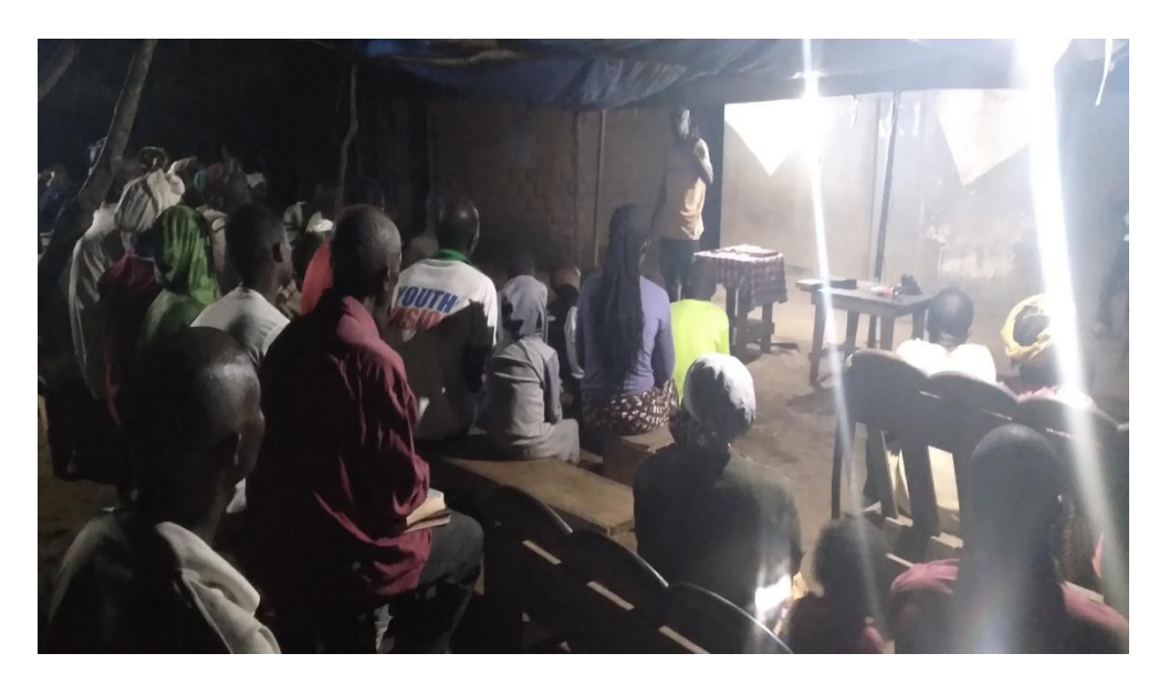
Lisco evangelism meeting, this was done in the night.