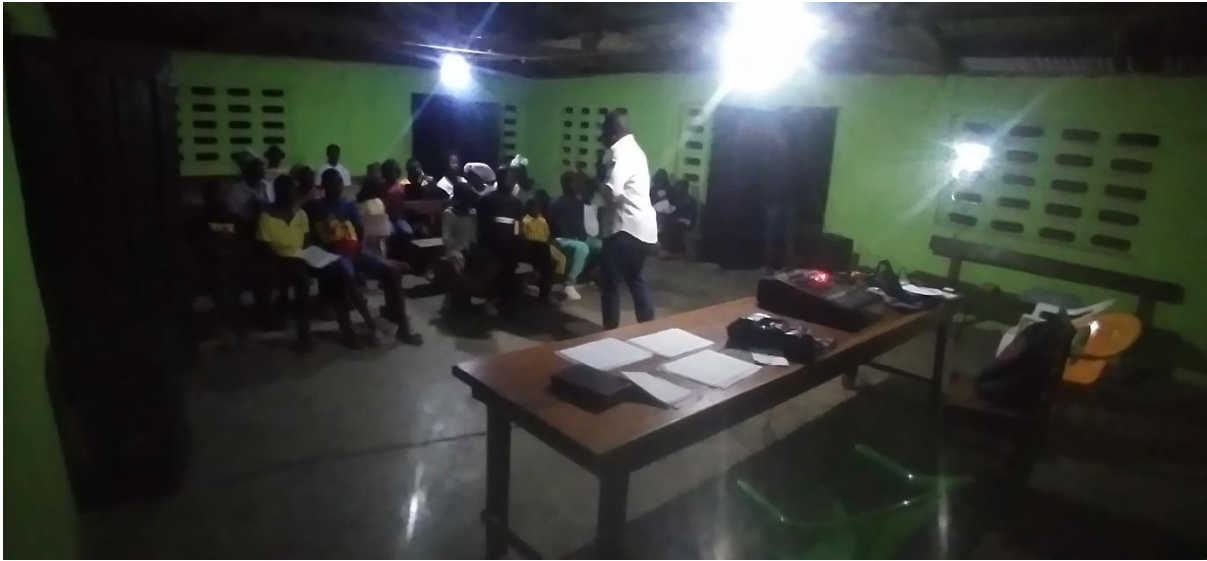
Kissi Quarter outreach gospel Meeting held on August 25, 20233.