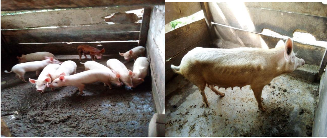
Pig Project for Church Children