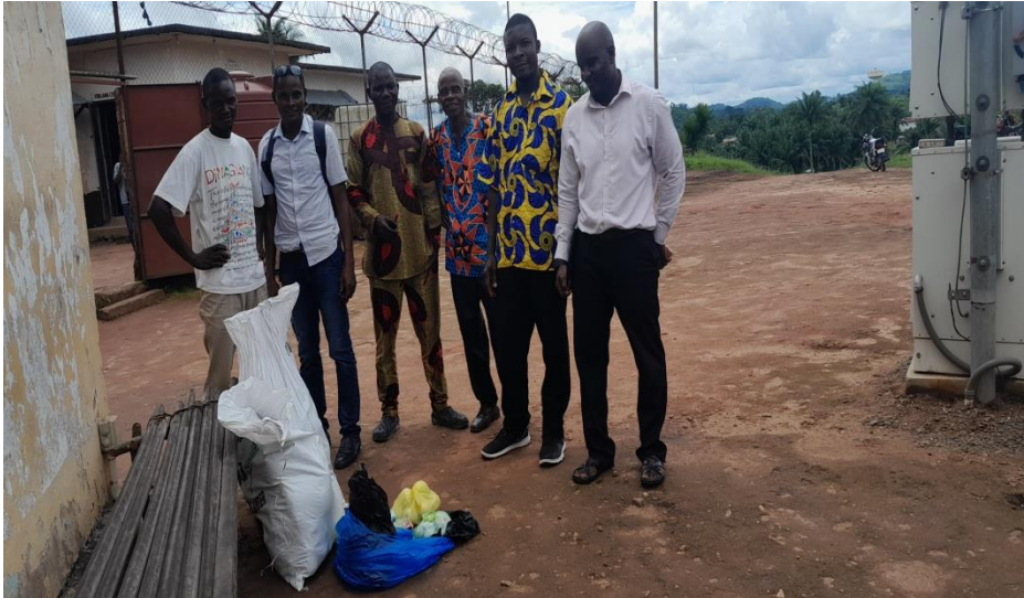
Distribution of sanitary and food items to the Voinjama Central Prison