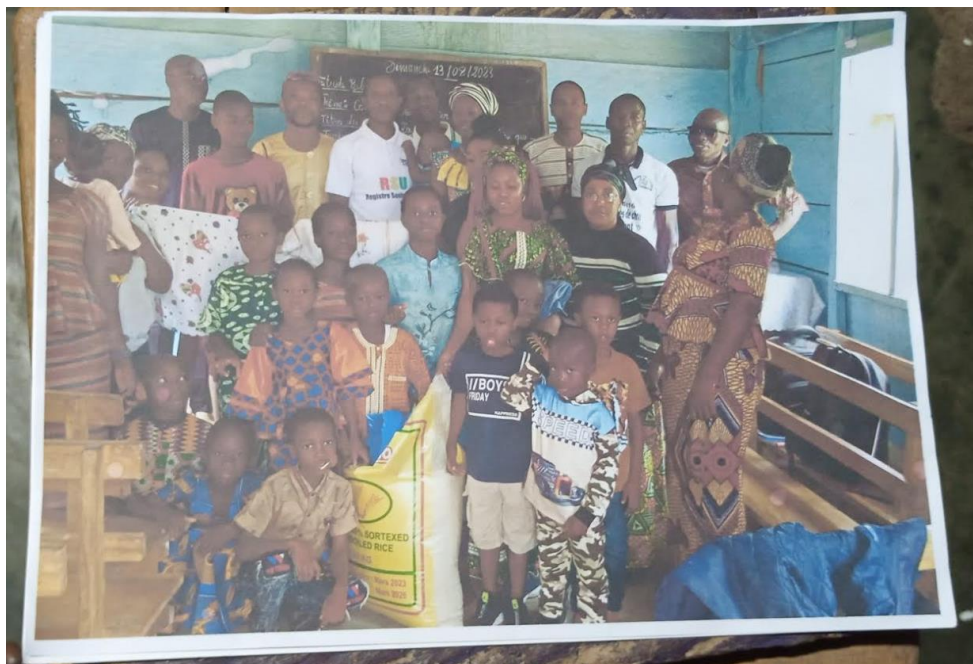
Brethren in Mohomou receiving their rice purchased through the support provided through Mission Guinea.

We appreciate your support of Mission Guinea and ask that you keep this work and the brethren in Guinea and Voinjama- Liberia in your prayers.