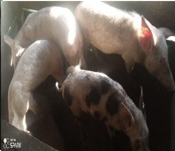
VISITATION, PIG'S FOOD AND PIG'S PROGRESS