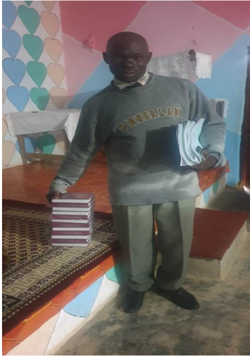
Sharing Bibles and Hymns