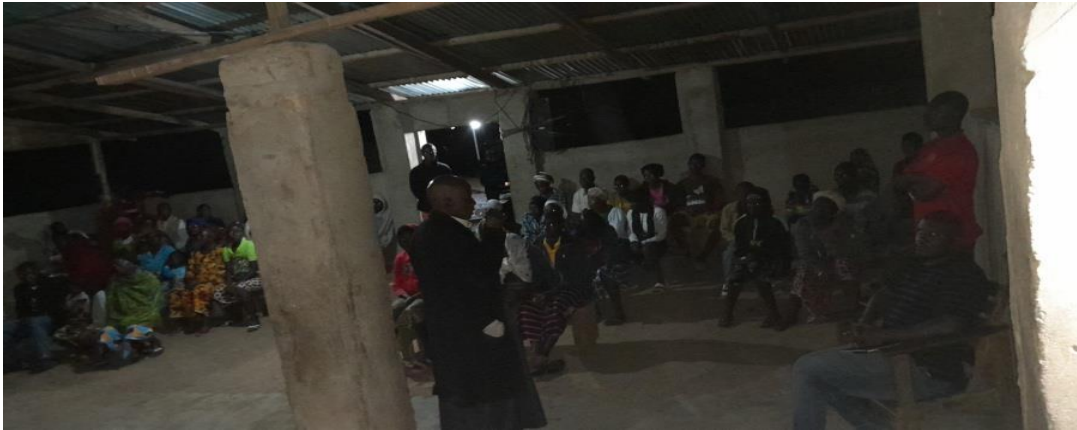
Kubemai Town outreach gospel meeting—two days meeting

This oldman is one of the elders of the Pentecostal church making remarks