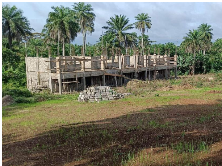
The Bible School construction progress so far.