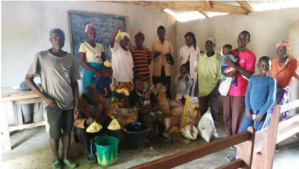
Brethren in Laine Refugee Camp receiving their provisions with the support provided through Mission Guinea.

We appreciate your support of Mission Guinea and ask that you keep this work and the brethren in Guinea and Voinjama- Liberia in your prayers.