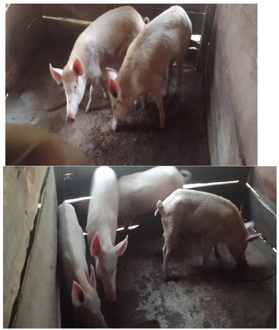
Pig Project for the Children of the Church