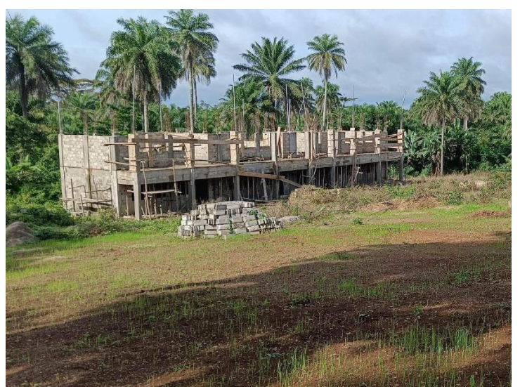
The Bible School construction progress so far with ground floor completed and first floor almost completed.