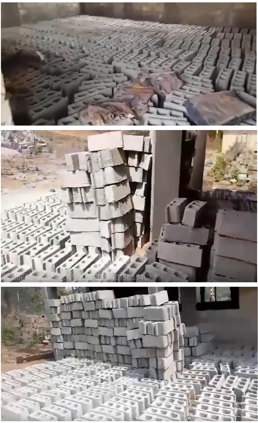
The newly made bricks ready for the first floor roof (second floor).