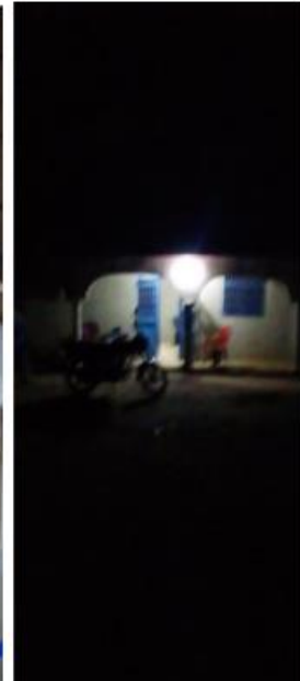
PREACHER4S HOUSE ELECTRIFICATION