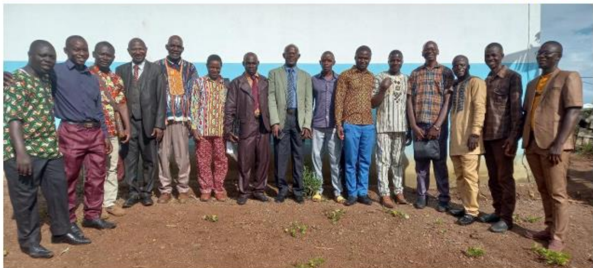
YOUTH BIBLE CAMP IN IMAGE